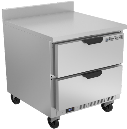
*Note: Shown with optional full electronic control

7 Year Parts/Labor Warranty 7 Year Compressor Warranty